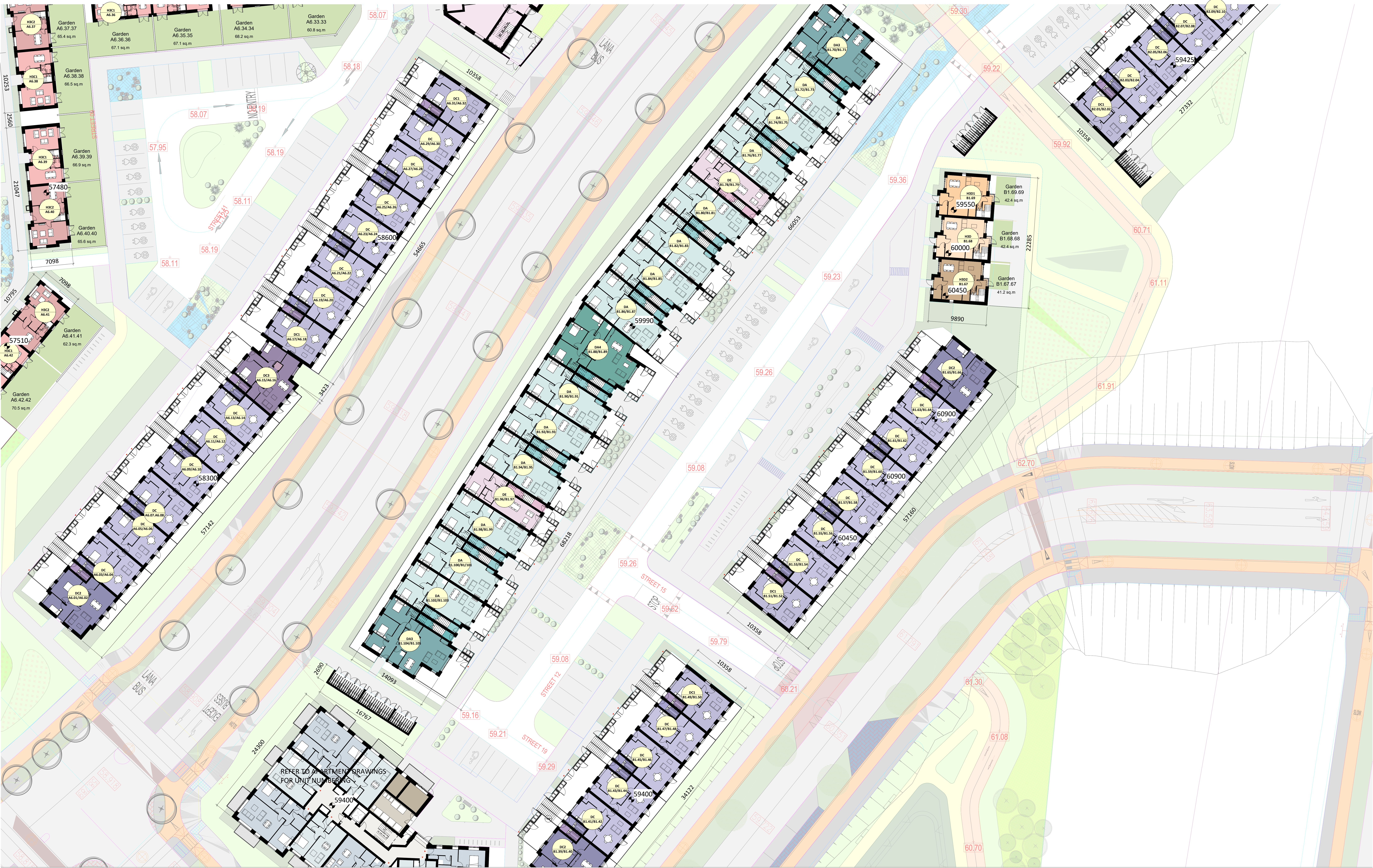
Site 3 Quadrant 4